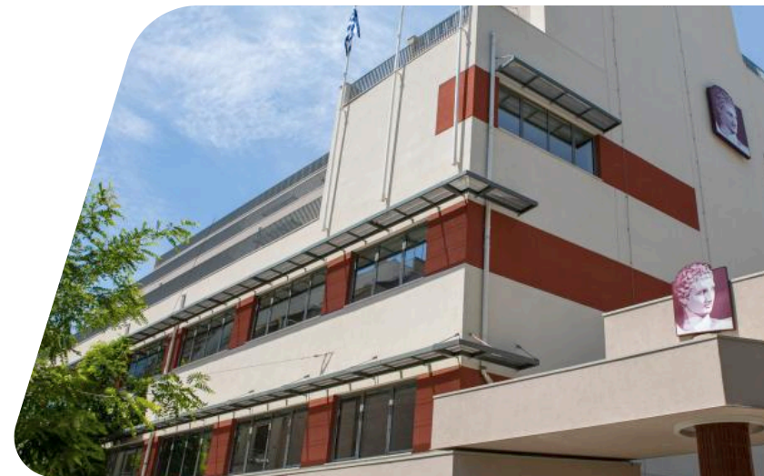
Building at 2 Troias, Spetson & Kimolou St.